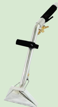
10" stair tool short, 29" long 900-0080