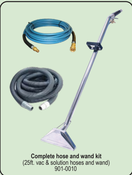
Complete hose and wand kit (25ft. vac & solution hoses and wand) 901-0010