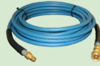
25' Solution hose assembly 201-0004