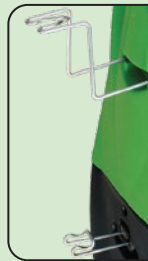
Retractable wand and hose holder kit 901-0011