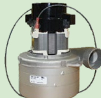
3 Stage Motor 500-0010