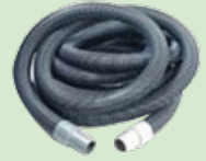
25' Vacuum hose w/ cuffs 201-0006