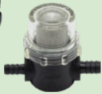
In-line clear view filter 500-0031