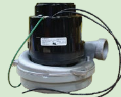
6.6 High Power Motor 500-0041