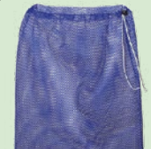
Nylon Hose Bag 900-0085