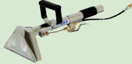
10" Stair-detail tool, 18" long 900-0083