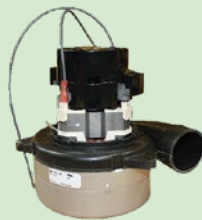
2 Stage Tangential Motor 500-0005