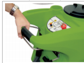
BRUSH CONTROL WITH AUTOMATIC DELAYED STOP