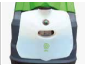
SEPARATE DETERGENT DOSING SYSTEM (OPTIONAL)