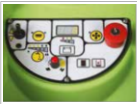
INTUITIVE CONTROL PANEL