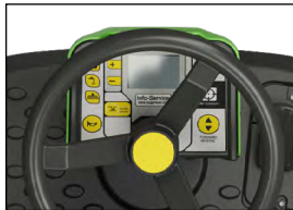
PRESET WORKING PROGRAMS