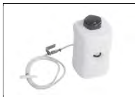
CHEM DOSE SYSTEM