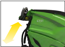
ADJUSTABLE HANDLE FOR COMFORTABLE AND EASY USE