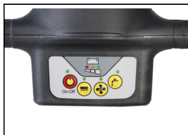
PRESET WORKING PROGRAMS