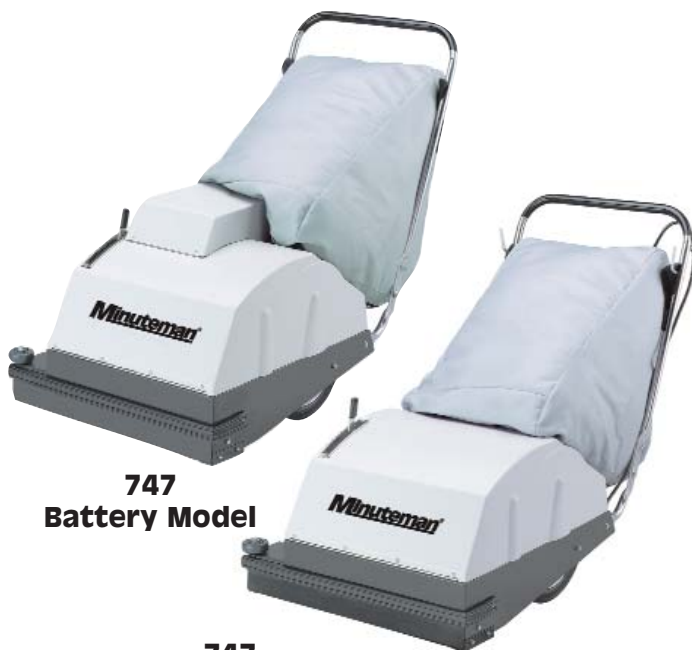
747 Battery Model