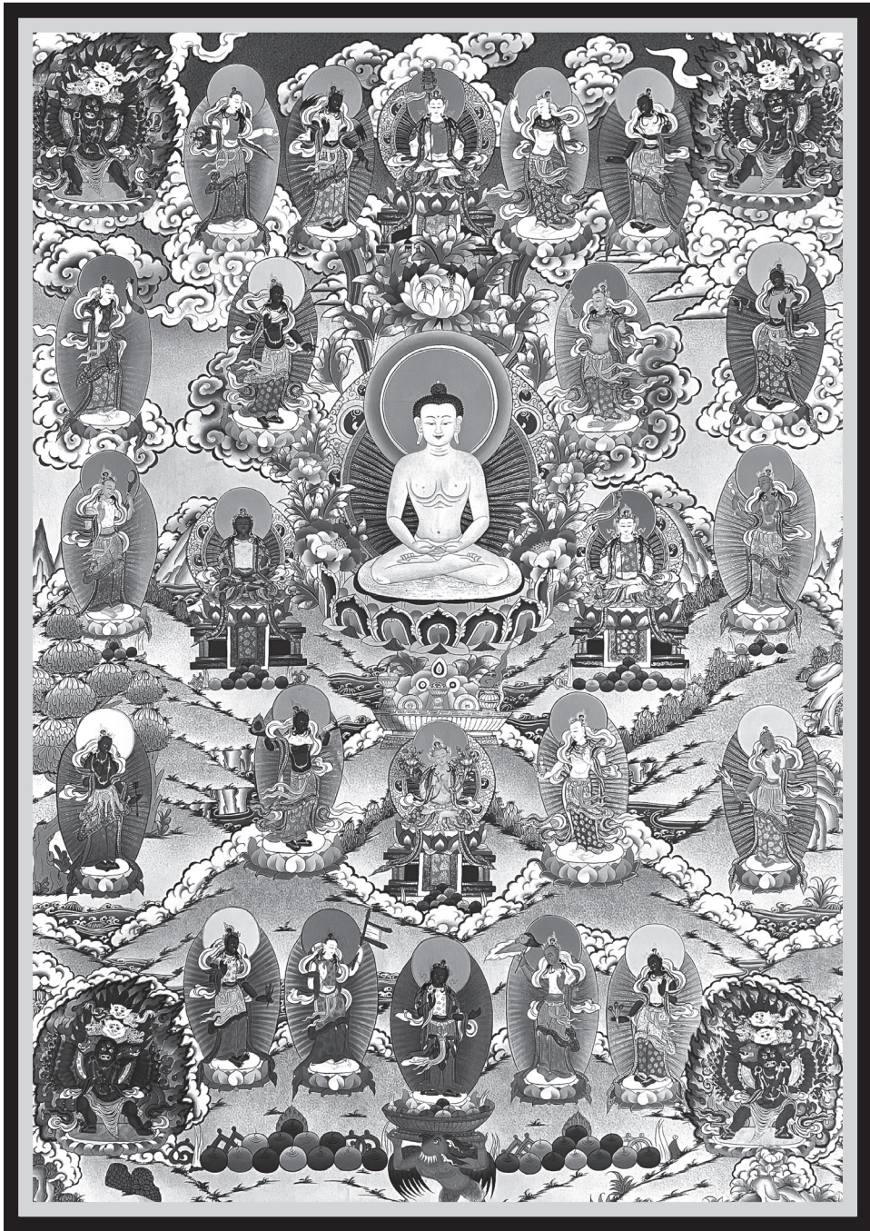
Du Tri Su Dip Jong Thangka