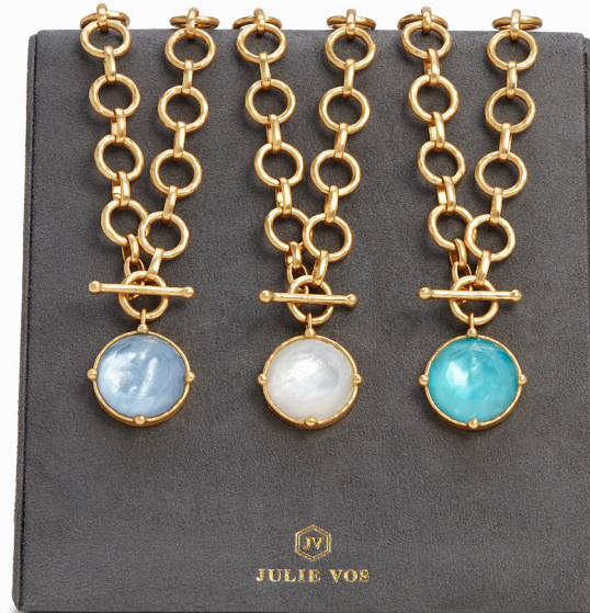
Medium Necklace Display