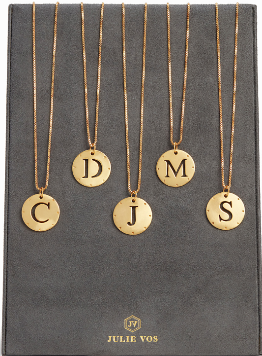
Large Necklace Display