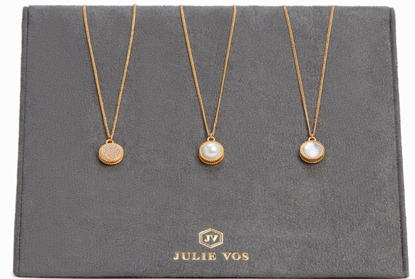
Small Necklace Display