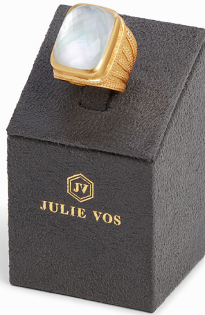
Tall Ring Display