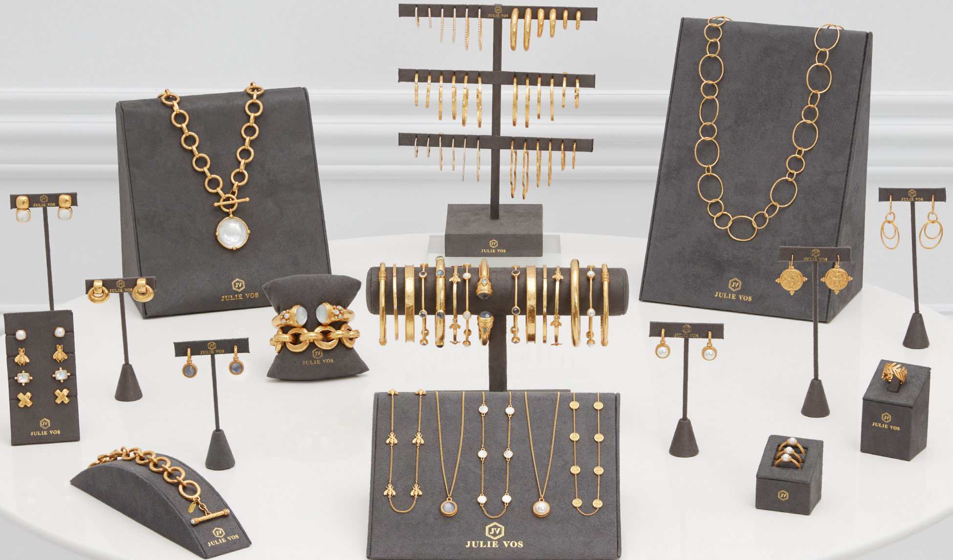
Table diameter: 39in