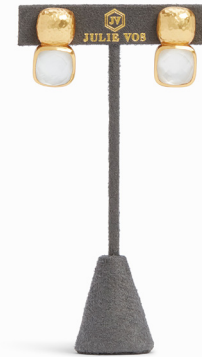
Short Earring Display