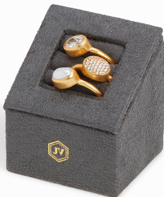
Stacking Ring Display