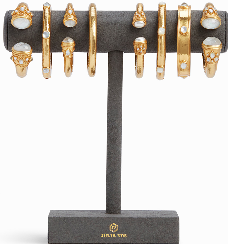
Tall Bangle Stand