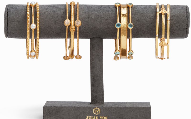
Short Bangle Stand