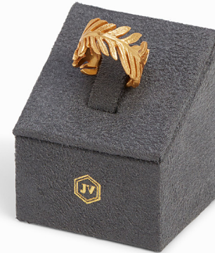
Short Ring Display