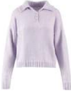
SENSITIVE SOUL HAPPINESS 65% cotton (pima), 35% nylon Pattern# 273-019-001