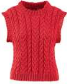
PRETTY PERFECT SUNSHINE 100% organic cotton (mercerized)