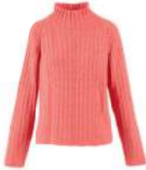
I-AM-BLESSED HAPPINESS 65% cotton (pima), 35% nylon