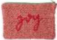
I-AM-JOYFUL PRIDE 40% linen, 32% cotton, 28% viscose