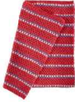
SUNNY SUMMER PRIDE 40% linen, 32% cotton, 28% viscose