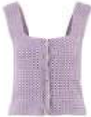
TAKE-THE-CHANCE SUNSHINE 100% organic cotton (mercerized) Pattern# 273-021-001