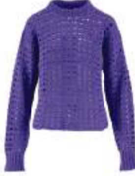
CUTE-AND-CONFIDENT SUNSHINE 100% organic cotton (mercerized) Pattern# 273-016-001