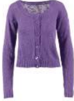
PURE ENERGY PRIDE 40% linen, 32% cotton, 28% viscose Pattern# 273-014-001