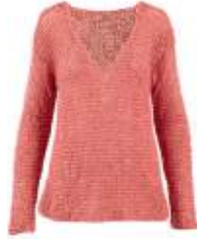
SECOND THOUGHTS PRIDE 40% linen, 32% cotton, 28% viscose