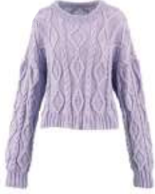
BE MAG(NET)IC SUNSHINE 100% organic cotton (mercerized) Pattern# 273-012-001