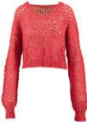
BE HUMBLE PRIDE 40% linen, 32% cotton, 28% viscose