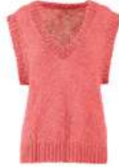
TRUE LOVE PRIDE 40% linen, 32% cotton, 28% viscose