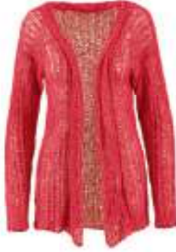
YOU ARE WORTHY PRIDE 40% linen, 32% cotton, 28% viscose