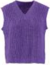
BE RARE HAPPINESS 65% cotton (pima), 35% nylon Pattern# 273-018-001