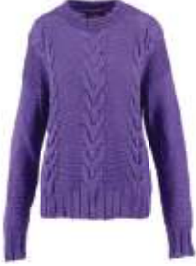
TOO BRIGHT SUNSHINE 100% organic cotton (mercerized) Pattern# 273-015-001