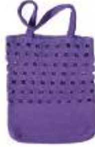
CALM-AND-CARELESS JOY 50% organic cotton, 50% liocel Pattern# 273-017-001