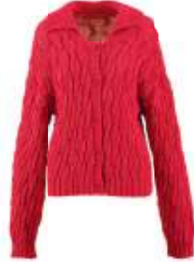
I-AM-LOVED JOY 50% organic cotton, 50% liocel