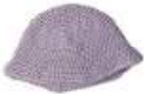
BE AUTHENTIC SUNSHINE 100% organic cotton (mercerized) Pattern# 273-020-001