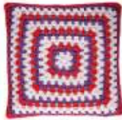
BEAUTIFIL BLOSSOM JOY 50% organic cotton, 50% liocel