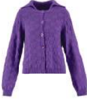
RARE SOUL HAPPINESS 65% cotton (pima), 35% nylon Pattern# 273-013-001