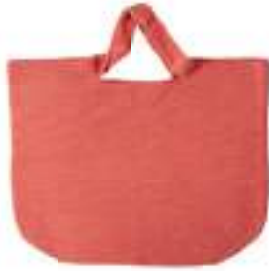
SUMMER SELF-CARE JOY 50% organic cotton, 50% liocel