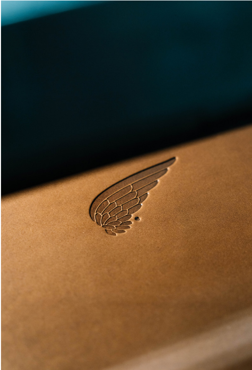
Red Wing Shoe Co.