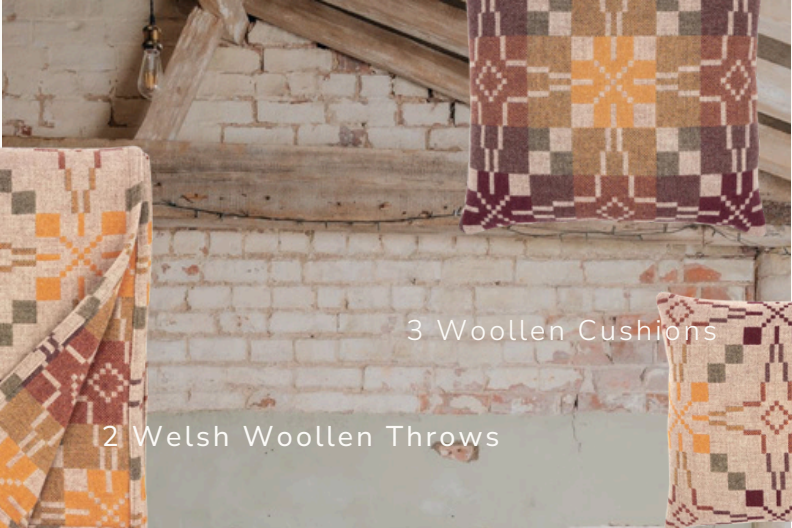
3 Woollen Cushions