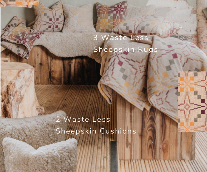
3 Waste Less Sheepskin Rugs