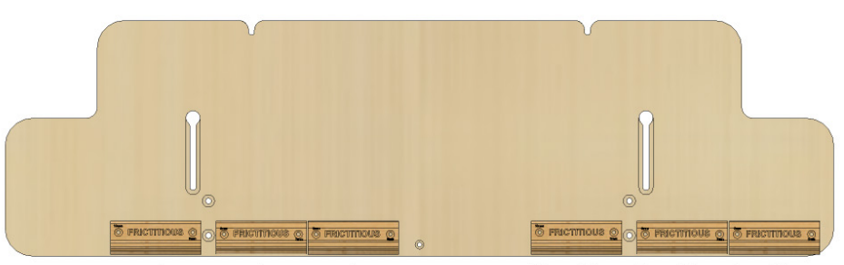
10mm / 9mm 8mm / 7mm 6mm / 5mm

Whether mounting on the doorway mount, or elsewhere, we recommend the following layout to ensure even spacing for each set of micros.