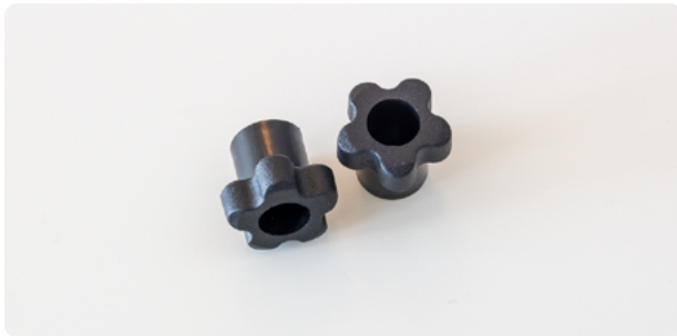
2x Thumb Knobs