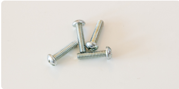
4x Bracket Screws