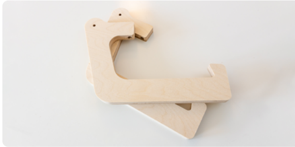
2x Rotating Hooks