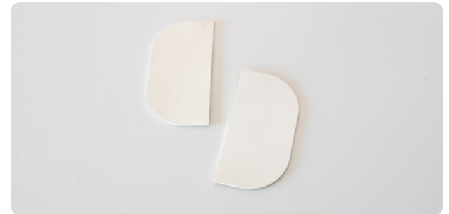
2x Rubber Pads