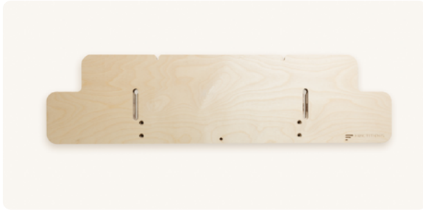
1x Mounting Board