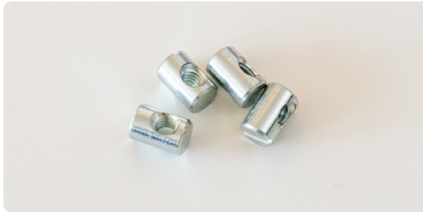
4x Dowel Nuts