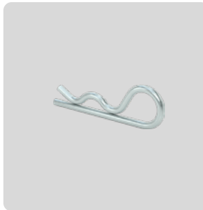
2x Clevis and 2x Cotter Pins