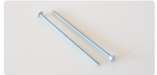
2x Carriage Bolts