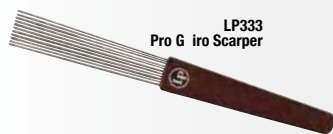
LP333 Pro G iro Scarper