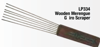
LP334 Wooden Merengue G iro Scraper