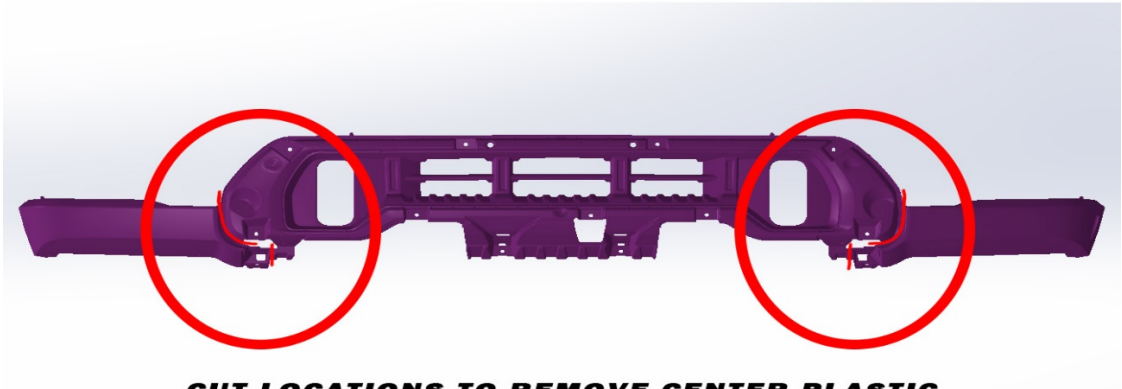
CUT LOCATIONS TO REMOVE CENTER PLASTIC