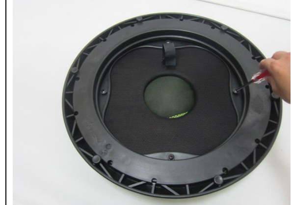
3. Fix the plate and plywood by the screws and washers