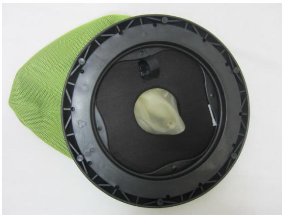
4. Put the PVC ball into the ball cover