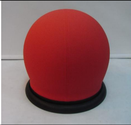
Big ball chair