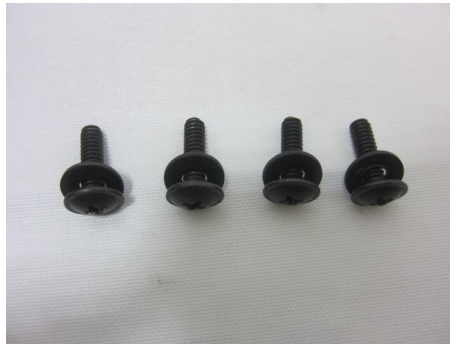
2. 4 screws and washers