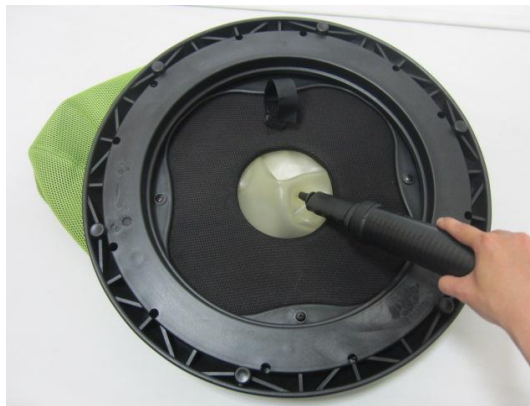
5. Use the hand pump