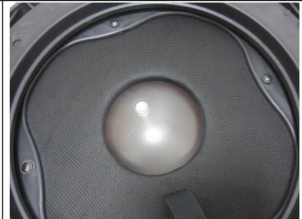
6. After finishing pumping, put the plastic plug in.