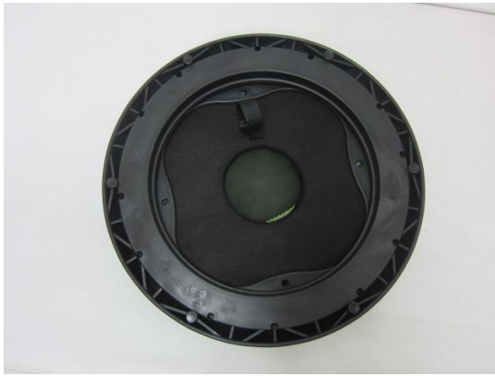
1. Put the rotation base plate onto the plywood