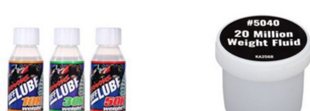
The TRA5136X Differential Oil Set includes 10,000, 30,000, and 50,000 wt oils. Traxxas' thickest fluid is 20,000,000 wt, and is used in the Torque Biasing Center Drive of Traxxas 6S- and 8S-powered models.

All Traxxas 4X4 models and all trucks with 4s, 6s, and 8s power systems use grease or silicone oil inside their sealed differentials to control diff action. We all think of a slippery liquid when the topic is oil, but as model size, power, and weight go up, thicker differential fluid is required to prevent unloading, and the silicone oil used in differentials can be so highly viscous ("thick") that it behaves more like syrup. The thickest Traxxas differential fluid is reserved for the largest and heaviest trucks such as X-Maxx and XRT. This stuff has an astonishing viscosity of 20,000,000 and is closer to putty than what anyone would think of as "oil."