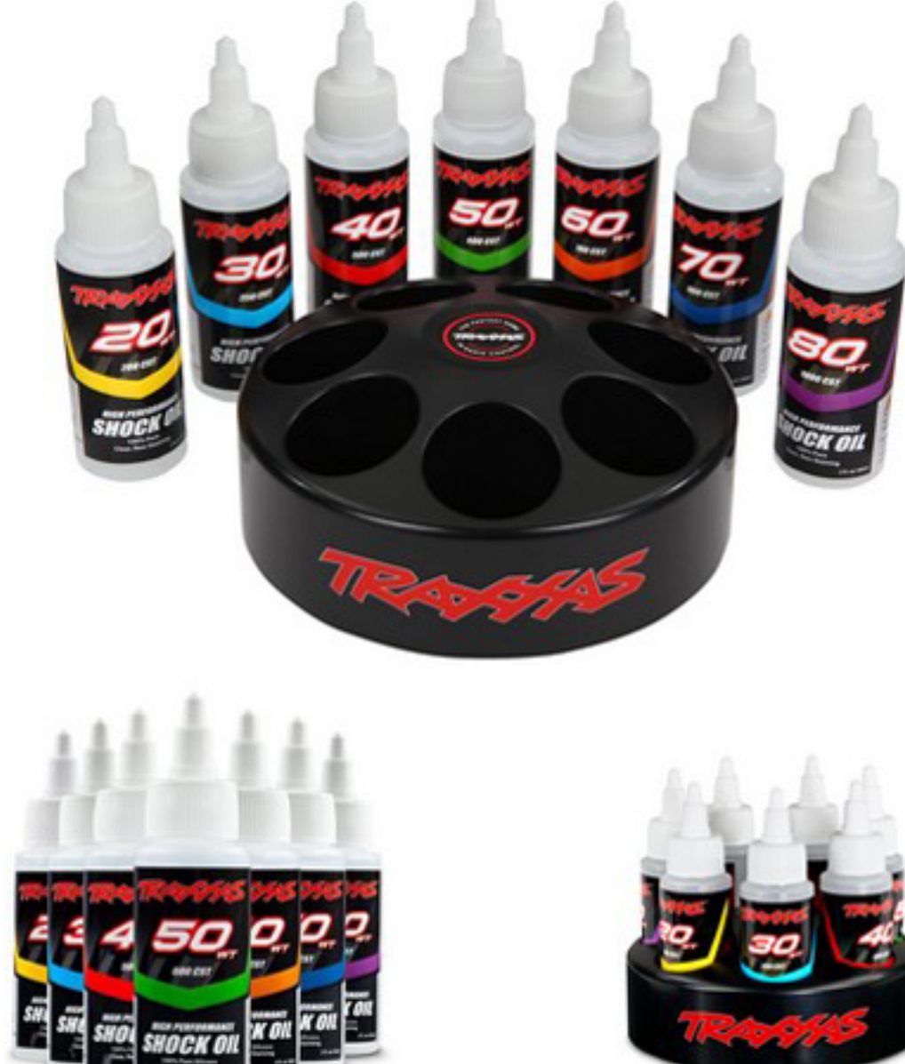
Traxxas High Performance Shock Oil is available in seven weights, and the 2 oz. bottles feature twist-open nozzles that pour precisely and close tightly.

All Traxxas models use silicone oil as the damping medium in their shocks. Traxxas oils are carefully manufactured to ensure precise viscosity from batch to batch, so you can be confident the bottle of 30-weight shock oil you purchase today will have exactly the same viscosity as the bottle you bought last year, and the one you buy next season.