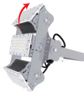
Module rotatable 90°