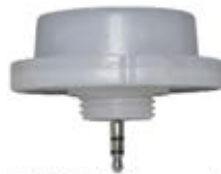
ANT-5-4T ( sensor )