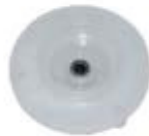
ANT-5-4B ( connecting base )