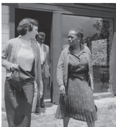
Ella Baker and Anne Braden leaving Civil Rights movement strategy meeting at the Highlander Center