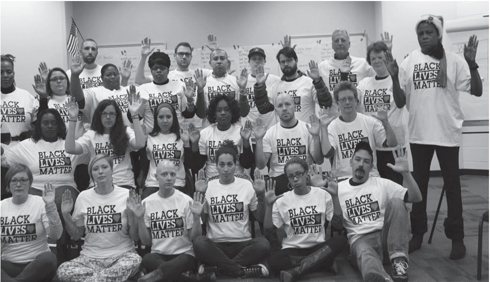
Public School Teachers Organizing in North Carolina.

For two pretty accessible beginning-to-think-about-these-issues books, I would recommend Paul Kivel’s Uprooting Racism: How White People Can Work for Racial Justice and Beverly Daniel Tatum’s “Why Are All the Black Kids Sitting Together in the Cafeteria?” And Other Conversations About Race.