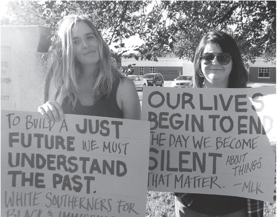
Dardanelle, AR population 4600.

When you leave out challenging the structures of power, then our work against racism and white privilege can very quickly become focused on individual behavior. Without a power analysis, then it can become just about raising awareness, without the larger goal of making structural change. Structural change requires building move-