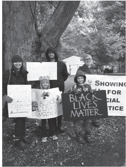
SURJ Families Protest in Louisville, KY.

Third, to help build and nurture my family with liberation values/culture as part of a larger beloved community that loves kids and honors the magic of childhood.