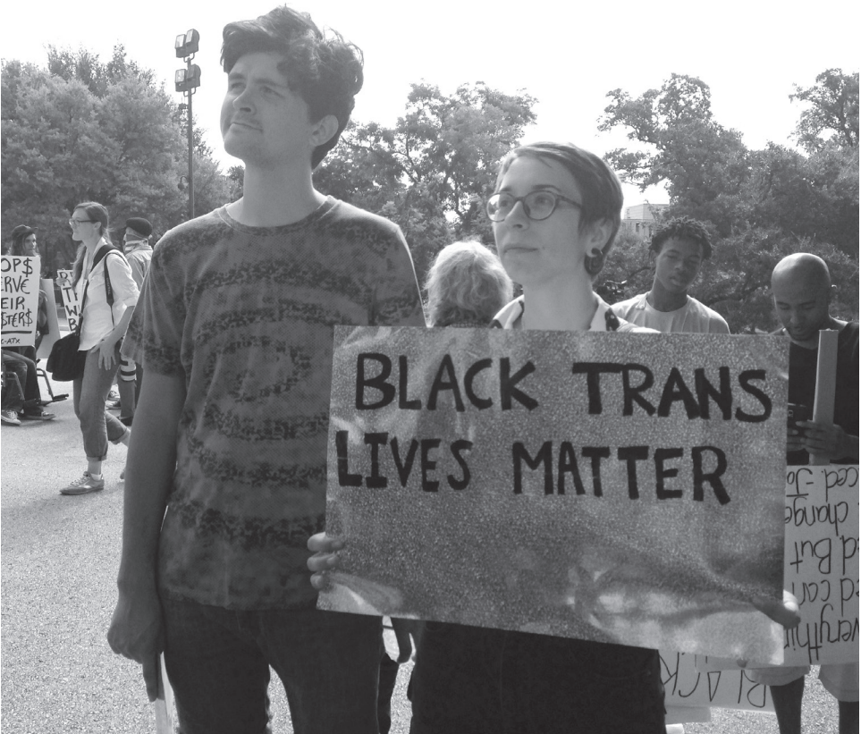
Rally Against Police Brutality at the Texas State Capital.

All Lives Matter is the new “special rights” smear tactic utilized by the White Citizen’s Councils and Klan against the Civil Rights movement. Which side are you on? To those who argue “all lives matter,” remember, just as we look back on those who declared “Segregation Today, Segregation Tomorrow, Segregation Forever,” history will see you.