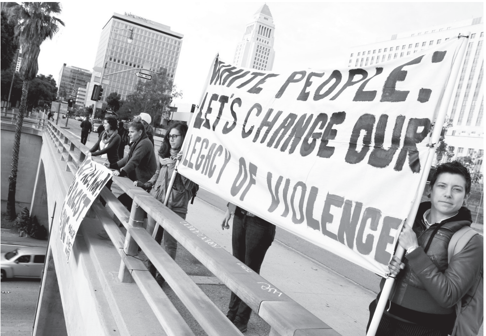
Banner hang in Los Angeles, CA.

For those of us who are white and have been engaged in anti-racist efforts, we need to support other white people to tap into their grief, pain, and sadness about Charleston and turn it into a commitment to the destruction and abolition of institutional racism. No calls for healing disconnected from militant resistance from white people against this brutal racist society. No messages meant to soothe white people’s souls, and ease them/us back to sleep. We need messages and leadership to help build the capacity of white people to stay in discomfort, to stay in the dis-ease to truly hear and listen to the voices and experiences of Black people, with the goal of putting raised consciousness into action against racism.