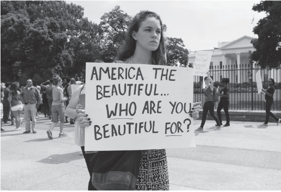
Mike Brown Silent Protest at the White House, Washington D.C.

For all of us who want to move white people into anti-racist consciousness and actions, we must remember the dual role that anti-Black racism plays in disciplining white people to capitalist exploitation. Anti-Black racism was most famously fused into popular culture and ideology through the Blackface minstrel shows. The minstrel show became the national art form by the mid-1800s, and