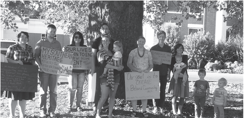
Working class communities rally in Dardanelle, AR.