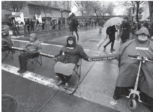
Shutting Down Oakland, CA Police Department.