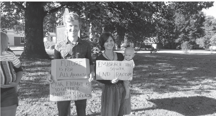
Dardanelle, AR.

But often times people come to me and want to know how they can convince someone in their family who they love, but who they doggedly oppose politically. My response is this is that we need to spend less time trying to move people who aren't moveable and focus our energies on people around us who, in moments like the uprising in Ferguson, are actually moveable. People around us who are asking questions, who