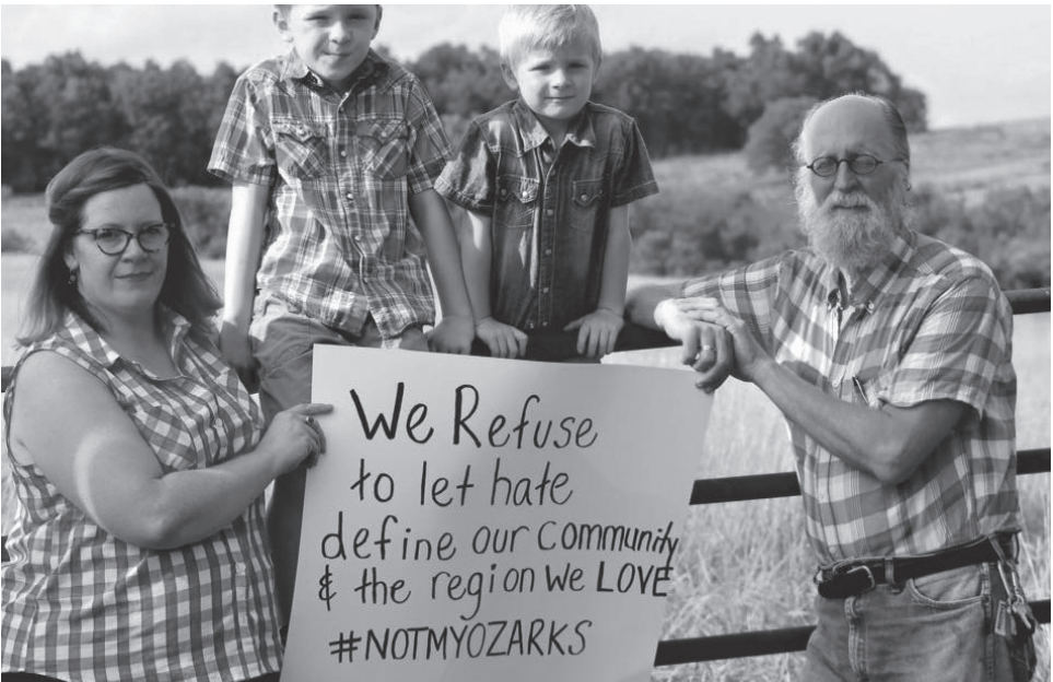
Not My Ozarks anti-racist, anti-Klan campaign.

The more I worked in white communities against racism and for racial justice with a collective liberation vision, the more it became spiritual work. It was spiritual as I began to see and experience the devastation of white supremacy on white communities. I had seen it in my own family, in my Grandfather and in my uncles: the resentment and anger towards Black and Brown communities, anger and resentment that was toxic and ate away at their and other white people's humanity, their sense of justice, safety, and democracy in the world. Now, as a father with two young white boys, I understand anti-racist work as fighting against the monstrosity of white supremacy that steals the lives of Black and Brown children and devours the humanity of white children.