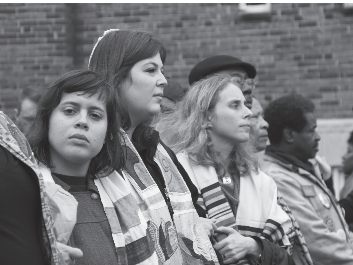
Rabbis and Jewish activists march in Ferguson, MO.

For those of us who are white in the wake of the Charleston Massacre, an atrocity that sparked national outcry in the long history of the racist violence of the United States, it is not the time for us to call for racial tolerance, racial healing, racial dialogue, or racial understanding alone. When white people say these things, even with the best of intentions, the underlying message undermines Black rage. It erases Black pain and Black resistance and serves white people's guilt and grief with vague gestures that do more to confuse rather than clarify both the problem and the solution.