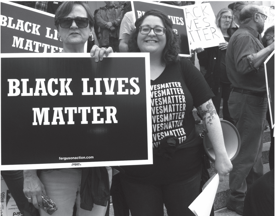
Rally Against the Aryan Brotherhood, St. Louis, MO.

“Beloved community isn't born of white hand-wringing but white hands going to work for revolutionary racial justice change.”