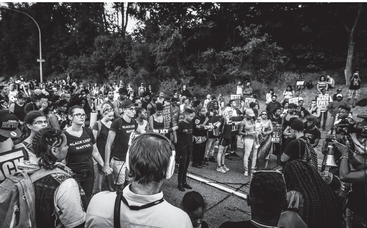
BLM direct action in Toronto, Canada.

But first, why is this a book written by a white person, for white people, when this is about the Black Lives Matter movement? I was radicalized by the Rodney