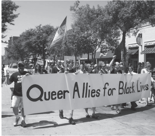
Wisconsin Pride.

up for and work for a world where Black lives matter, a world rooted in collective liberation—a world where we all get free, together.