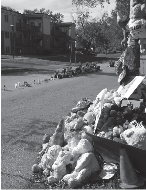
A memorial to Mike Brown at the shooting scene on Canfield Drive in Ferguson.

may be true, but, if you do take some steps, my hope is that this book is a source of encouragement to help you find your footing quickly.