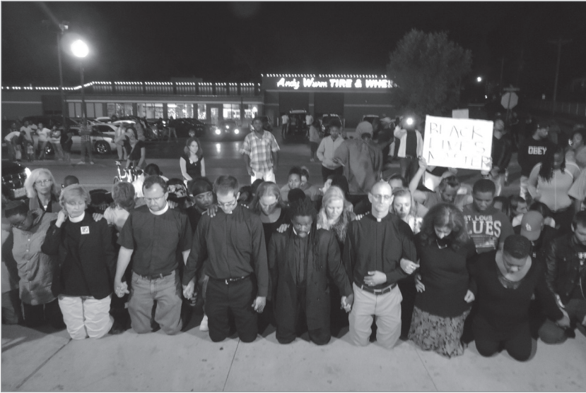
Clergy kneel to pray between police and protesters at the Ferguson police station on September 29.

altar of justice and made clear that their resistance was an action of their faith.