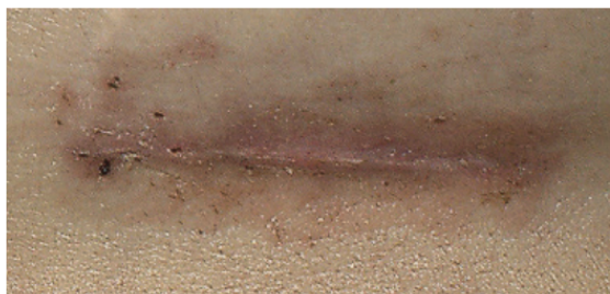
AFTER 3 MONTHS