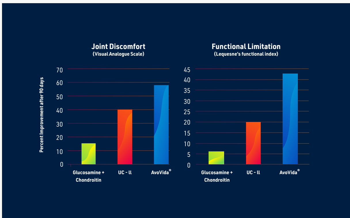
Figure 3. Percent improvement in A. joint discomfort and B. functional limitations with respect to three treatments, glucosamine + chondroitin, UC-II (undenatured type-II collagen) and AvoVida®

An alternative supplement in the industry is an undenatured type-II collagen called UC-II. While this ingredient has been growing in popularity, both AvoVida® and 5-Loxin® show strikingly stronger improvements on both joint discomfort and functional limitation. A comparison of the benefits from these ingredients as analyzed with identical measures over identical time frames is shown below.