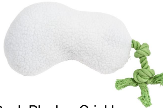
Back Plush + Crinkle