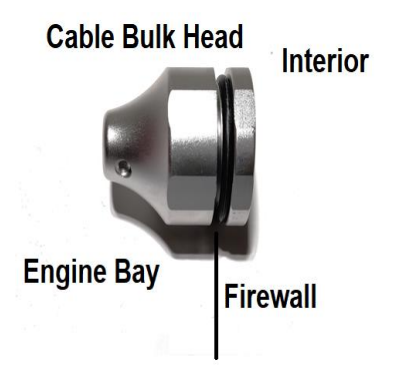
Step 3: Braided Cover Sizing

Install the Cable Bulkhead through the firewall. Ensure the cable bulkhead with the cone faces the engine bay, positioning the set screw at the 6 o'clock position. Please note 240z models require enlarging the hole 2-3mm Tighten snugly from inside. Do not feed the cable through just yet.