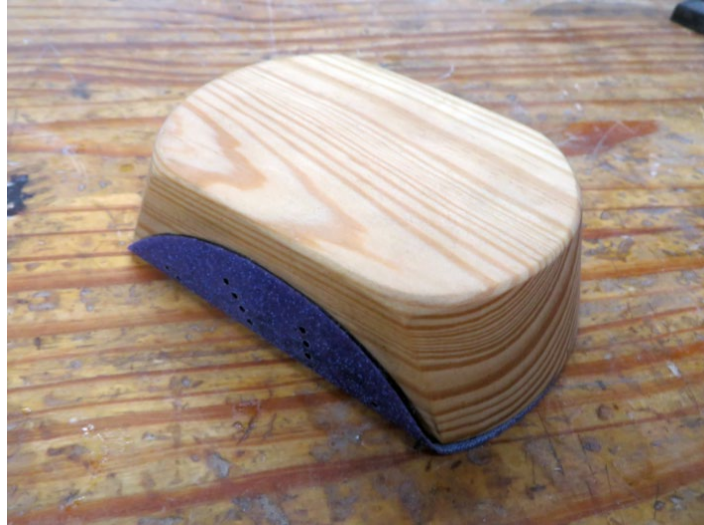
3" wide block from 1-1/4" thick scrap

A random orbital sander is in almost every shop. While most finish sanding operations can be performed using this tool, some sanding is best done by hand. Wrapping a sheet of sandpaper around a block of wood can work, but making a dedicated sanding block that accepts hook and loop discs can be a nice addition to any shop and will help you recycle those worn out discs. I made a sanding block from a scrap of wood and accepts 5" hook and loop discs. Its rounded shape fits my hand well and does an excellent job.