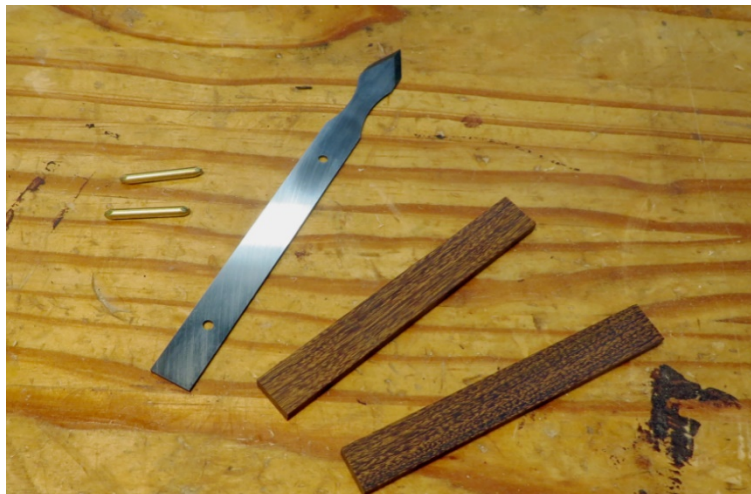
Knife kit with blank, brass pins and user supplied wood scales

These Mikov Dual Bevel Spear Point marking knives are made by Mikov, a world-class Czech knife maker. These blades can be used either unhandled or wood scales can be added to create a comfortable, easy-to-grip handle. These knife kits contain a blade blank and 2 brass pins needed to affix scales to the blade. All you need to add are the wood scales. Adding wood scales is very easy and a great way to use some of those small hardwood or exotic wood scraps you have lying around.