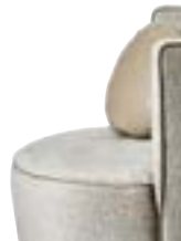
SAP600C Leather with Self piping