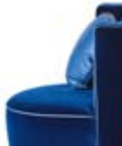
SAP600B Fabric with Leather piping