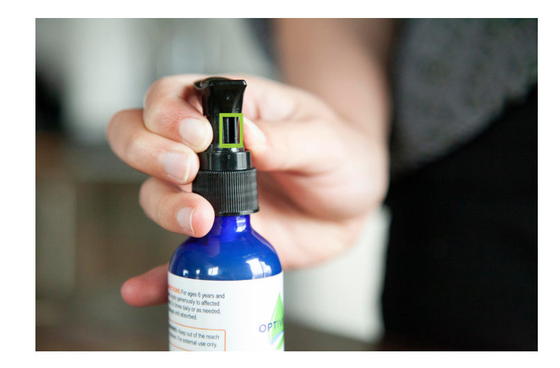
STEP TW0 Find the small gap on the neck.

STEP THREE Hold onto the neck and the nozzle. Spin the nozzle until it aligns with the gap in the neck.