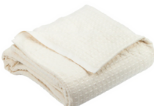
SPOSH WAFFLE WEAVE BLANKET JL748