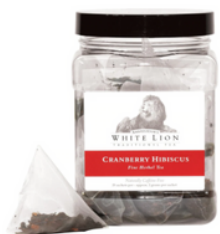
WHITE LION TEA CRANBERRY HIBISCUS WL261