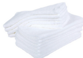
SPOSH WAFFLE WEAVE BLANKET JL714