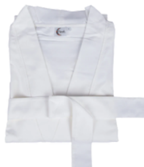
SPOSH URBAN MICROFIBER ROBE JL701