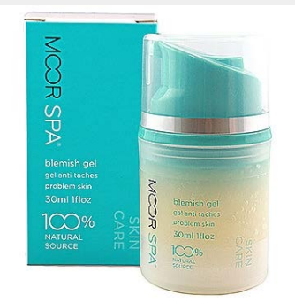
MOOR SPA BLEMISH GEL MRS174

Help ease tension in the temples with this unique cream, which combines moor extract with a wealth of soothing botanical extracts including feverfew, linden, peppermint and melissa oils.