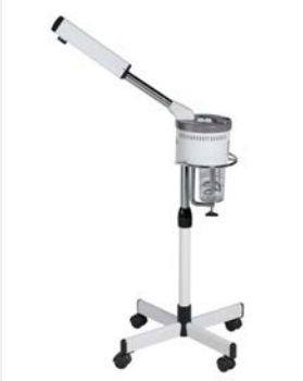
FACIAL STEAMER WITH OZONE & STAND C3723

This highly effective spot treatment gel combines soothing slippery elm bark with the purifying effects of pure moor extract. The gel may be applied underneath moisturizer to keep the pores clean.