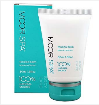
MOOR SPA TENSION BALM MRS237

Help ease tension in the temples with this unique cream, which combines moor extract with a wealth of soothing botanical extracts including feverfew, linden, peppermint and melissa oils.