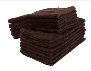
DARK TOWEL, 16X27, 12 PACK JL715