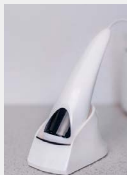
MOOR SPA SKIN ANALYSIS SYSTEM (RECOMMENDED) UC11