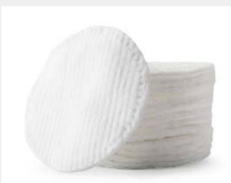
COTTON ROUNDS CX014T