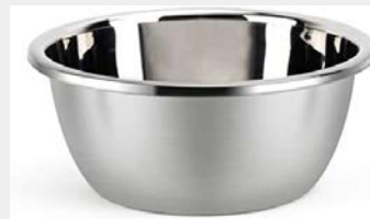
METAL BASIN C8179