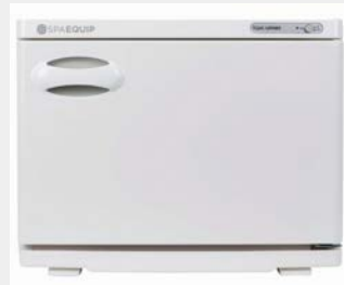
SPAEQUIP STANDARD UV TOWEL CABINET, WHITE SE0010