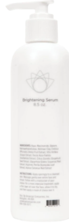
BRIGHTENING SERUM PVT125P