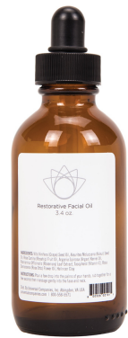
RESTORATIVE FACIAL OIL PVT142P