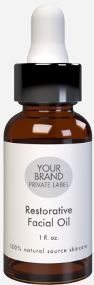
RESTORATIVE FACIAL OIL PVT142