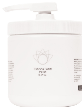
REFINING FACIAL POLISH PVT138P