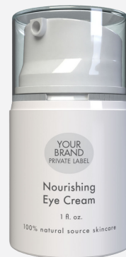
NOURISHING EYE CREAM PVT123