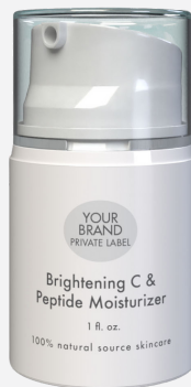
BRIGHTENING C & PEPTIDE MOISTURIZER PVT136