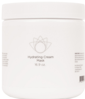
HYDRATING CREAM MASK PVT134P