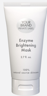
ENZYME BRIGHTENING MASK PVT124