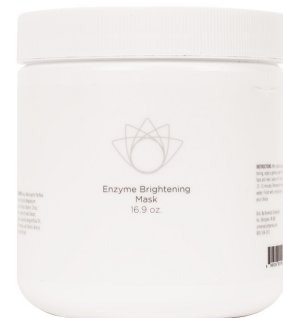
ENZYME BRIGHTENING MASK PVT124P