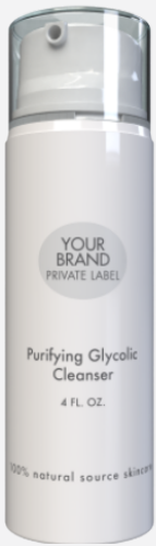
PURIFYING GLYCOLIC CLEANSER PVT140