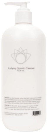
PURIFYING GLYCOLIC CLEANSER PVT140P