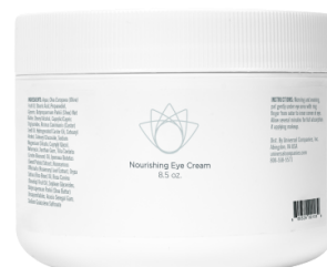
NOURISHING EYE CREAM LOTION PVT123P