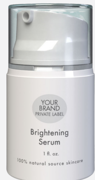
BRIGHTENING SERUM PVT125