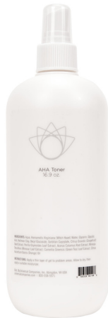
AHA TONER PVT145P