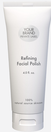
REFINING FACIAL POLISH PVT138