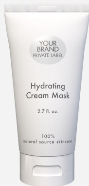
HYDRATING CREAM MASK PVT134