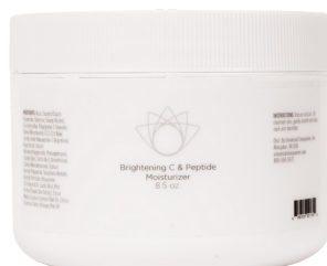
BRIGHTENING C & PEPTIDE MOISTURIZER PVT136P