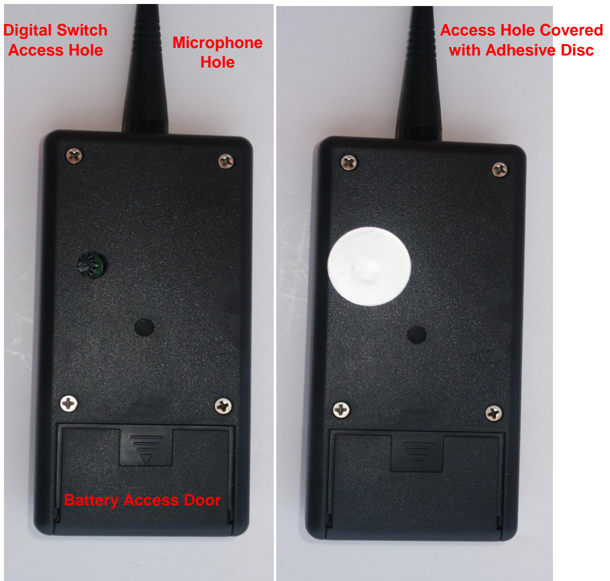
(Transmitter back shown without and with adhesive disc in place.)

The access hole for the digital switch enables the operator to view the switch setting and insert a small screwdriver to change it without having to remove the rear cover.