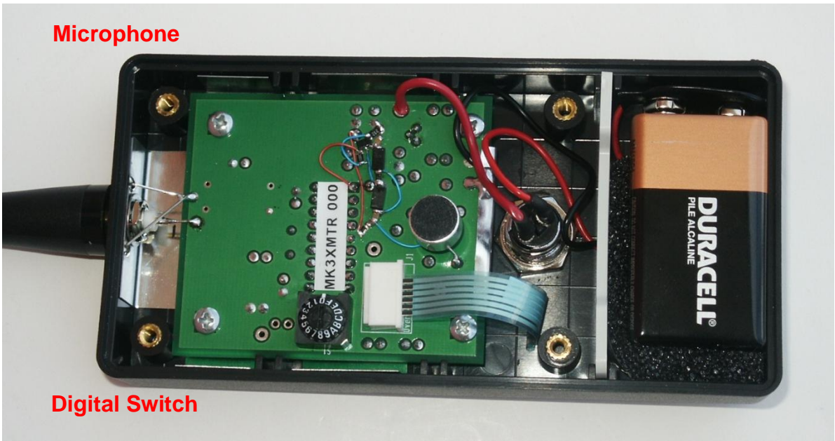
(Transmitter with rear cover removed)