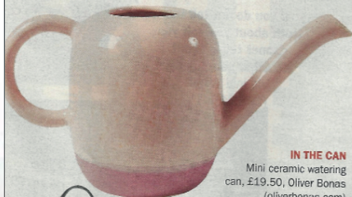
IN THE CAN Mini ceramic watering can, £19.50, Oliver Bonas (oliverbonas.com)

There's something for every budget in this week's must-have selection Compiled by Katy Gale