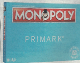
DO NOT PASS GO... Primark monopoly board, £18, Primark (primark.com)