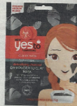
MASKED BALL Yes to Tomatoes Detoxifying Charcoal DIY Powder-to-Clay Mask, £4.99, ASOS (asos.com)