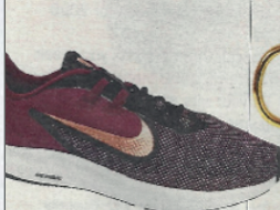
BORN TO RUN Nike Downshifter lace-up trainers, £44.99, Deichmann (deichmann.com)