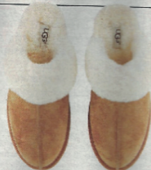
SNUG AS A BUG Ugg slippers, £80, Amara (amara.com)