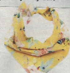
PET SHOP TOYS Floral bandana, £5.99, Pet Pooch Boutique (petpoochboutique.com)