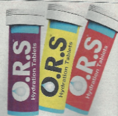
LIQUID ASSET Hydration tablets, £4.99 each, O.R.S (ors.uk.com)