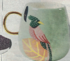
HOT TROPICS Tropical bird mug, £12, Oliver Bonas (as above)