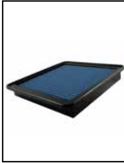
OE Replacement Air Filter

P/N: 30-10146 (P5R) 31-10146 (PDS) V8-4.6L/5.7L '07-'13