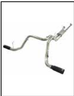
Dual Cat-Back Exhaust

P/N: 49-46014-B (Blk Tips) 49-46014-P (Pol Tips)