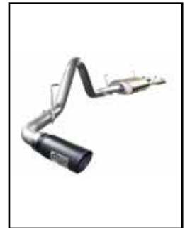
aFe Cat-Back Exhaust