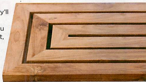
Photograph, bottom left: courtesy of Pottery Barn