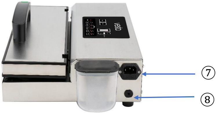
7. Power Cord Connection 8. Hose Connection