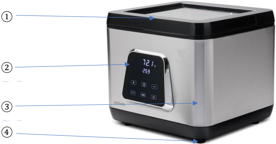
1. Lid 2. Control Panel 3. Main Body 4. Rubber feet