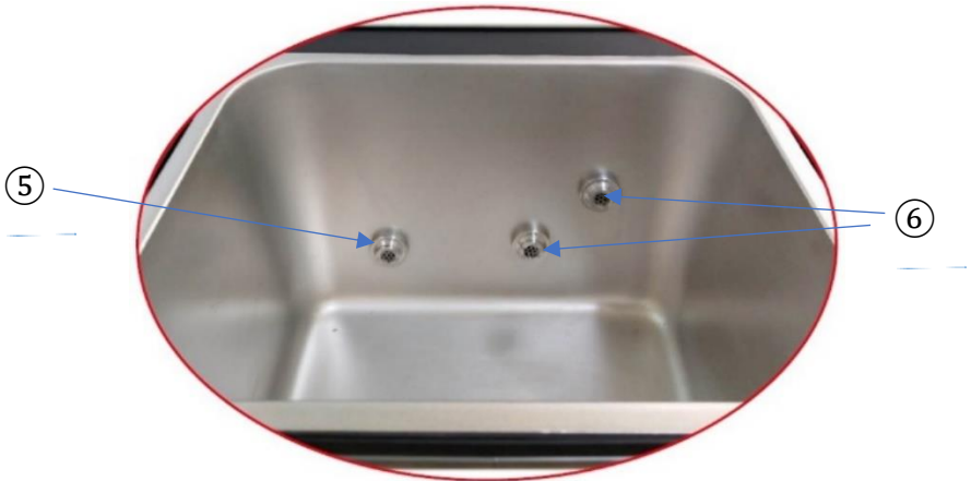
5. Pump Outlet 6. Water Inlet