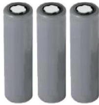
AA Battery x 3 (for Receiver)