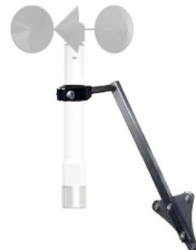
Magnetic Sensor Mounting Bracket