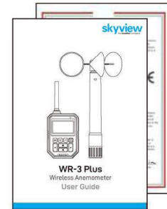
User Manual & Certificate