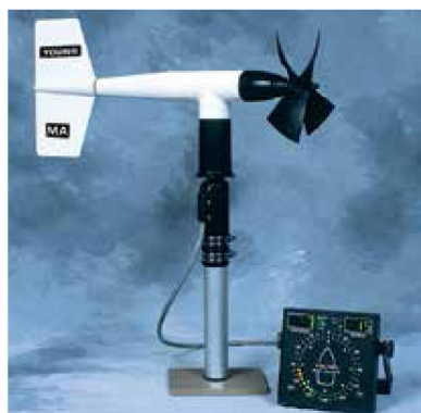
Wind Monitor – MA pictured with Marine Wind Tracker display.