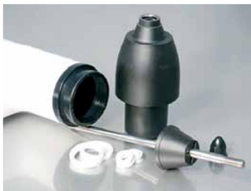
Ceramic bearings are long lasting and corrosion resistant.