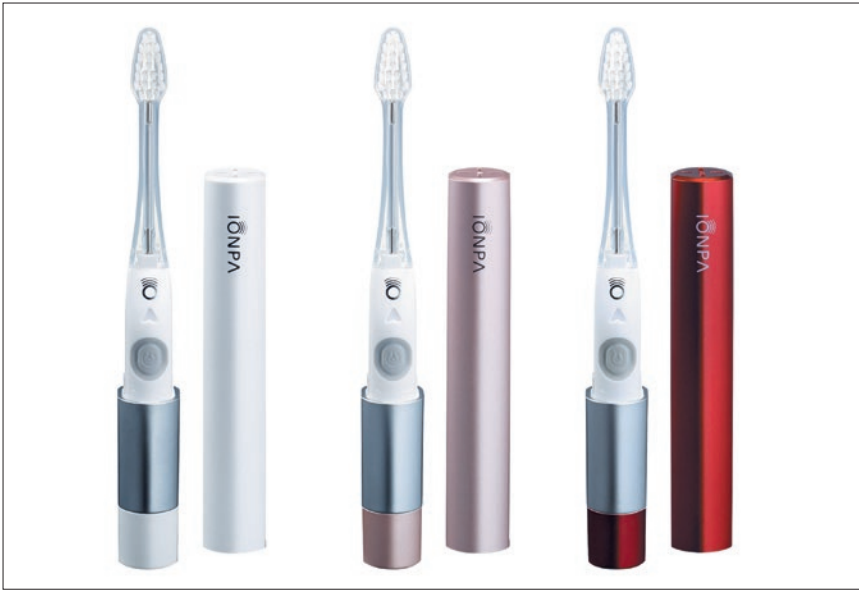
Fig 1 IONPA toothbrush.

created by saliva. 5 The negatively charged ions released by the toothbrush could reverse the polarity and draw plaque molecules toward the brush bristles.