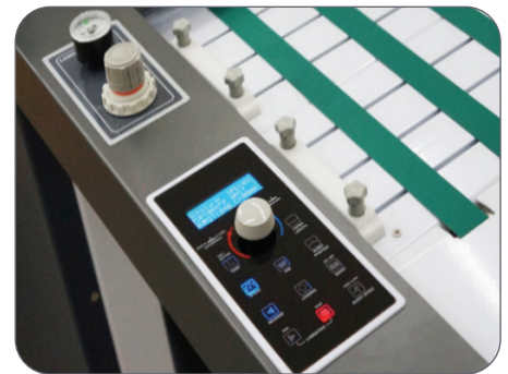
Capacitive touch screen