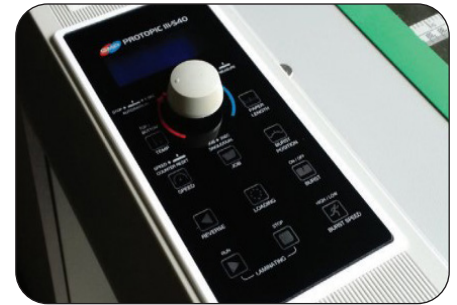
User-friendly touch screen