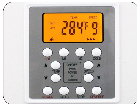
LCD control panel