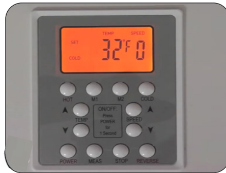
LCD control panel