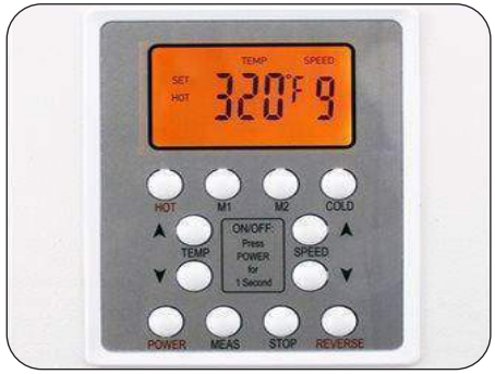
LCD control panel