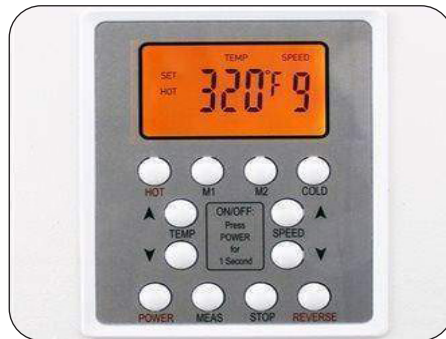
LCD control panel