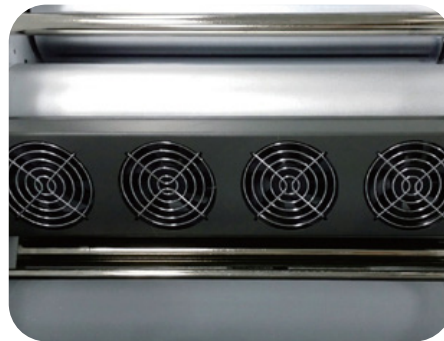
Air cooling system