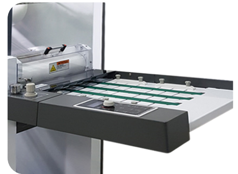
Foldable feeding table