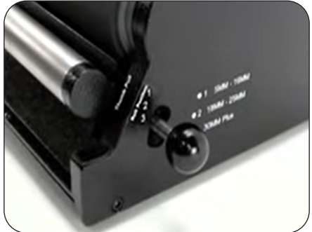
Coil size adiustment knob