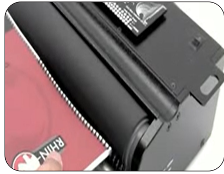
Double roller system