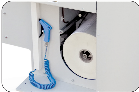
Double side lamination module